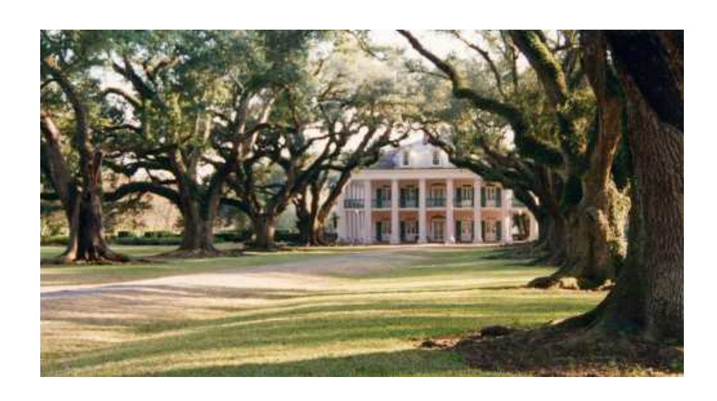
Hi-lite: What group dominated southern life?