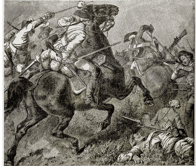
THE AMERICAN CAVALRY CHARGE AT MONMOUTH.